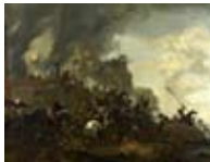
Cavalry making a Sortie from a Fort on a Hill, 1646 Philips Wouwermans

Oporto Bar 168 High Holborn London WC1V 7AA