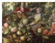
The Four Elements: Earth, 1569 Joachim Beuckelaer

Neals Yard Holland and Barratt 21-23 Shorts Gardens London WC2H 9AS