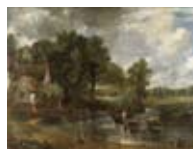
The Hay Wain, 1821 John Constable