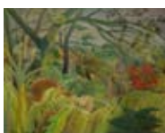
Surprised (Tiger in a Tropical Storm), 1891 Henri Rousseau