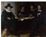
Four Officers of the Amsterdam Coopers' and Wine-rackers' Guild, 1657 Gerbrand van den Eeckhout