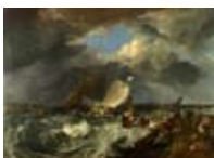
Calais Pier Joseph Mallord William Turner

Palace Theatre Shaftesbury Avenue London W1D 5AY