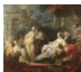
Psyche showing her Sisters her Gifts from Cupid, 1753 Jean-Honoré Fragonard

The Hippodrome Leicester Square London WC2H 7JH