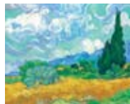
A Wheatfield with Cypresses, 1889 Vincent Van Gogh

The Soho Lounge 69 Dean Street London W1D 3SE