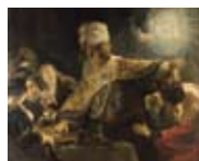
Belshazzar's Feast, about 1635 Rembrandt

Queens Theatre Wardour Street London W1D 6BA