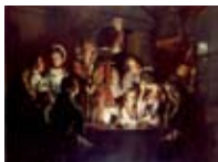
An Experiment on a Bird in the Air Pump 1768 Joseph Wright of Derby