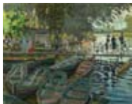
Bathers at La Grenouillère, 1869 Claude-Oscar Monet

Covden House 7a Langley Street London WC2H 9JA