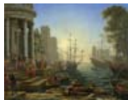
Seaport with the Embarkation of Saint Ursula, 1641 Claude

London Film School 24-26 Shelton Street London WC2H 9UB