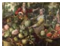
The Four Elements: Earth, 1569 Joachim Beuckelaer

Neals Yard Holland and Barratt 21-23 Shorts Gardens London WC2H 9AS