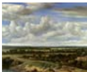
An Extensive Landscape with a Road by a River, 1655 Philips Koninck

Ching Court 15-17 Shelton Street WC2H 9EY