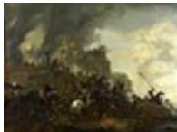
Cavalry making a Sortie from a Fort on a Hill, 1646 Philips Wouwermans

Oporto Bar 168 High Holborn London WC1V 7AA