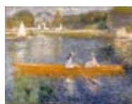
Boating on the Seine, 1875 Pierre-Auguste Renoir

The Organic Pharmacy 36 Neal Street London WC2 H9PS