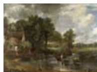
The Hay Wain, 1821 John Constable