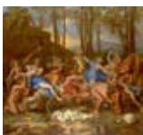
The Triumph of Pan, 1836 Nicolas Poussin